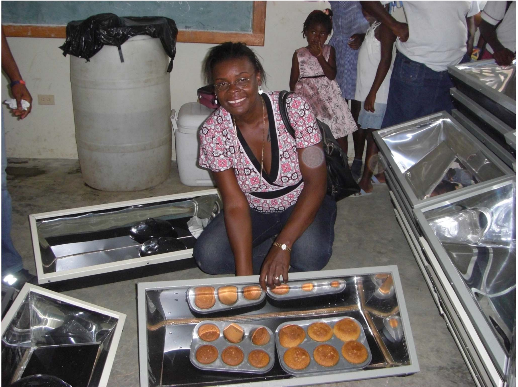
TRAINING includes new experiences like baking cupcakes!