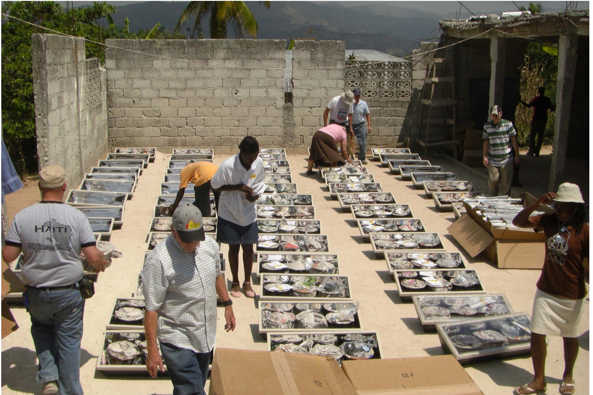
DISTRIBUTION of solar ovens to students who grasp the benefits... 100%+